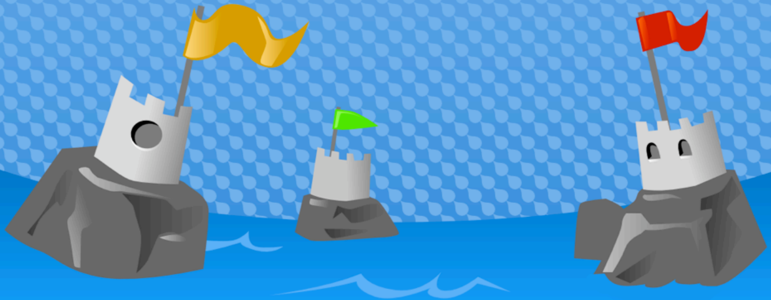
fig. 4 Turning an OG Drupal site into a set of city-states.