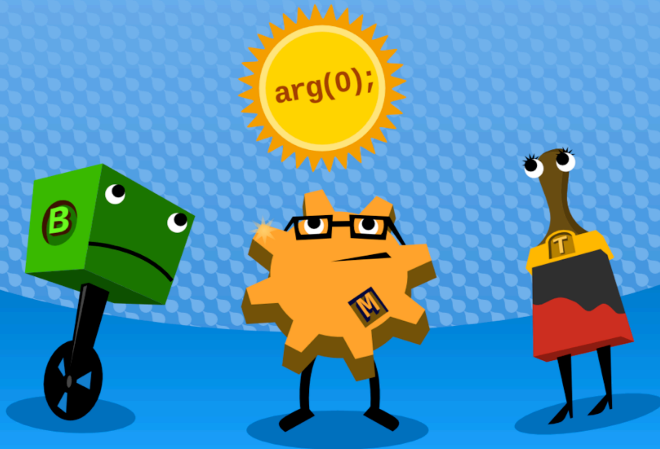
fig. 1 A block, module, and theme ponder how to react to arg(0)