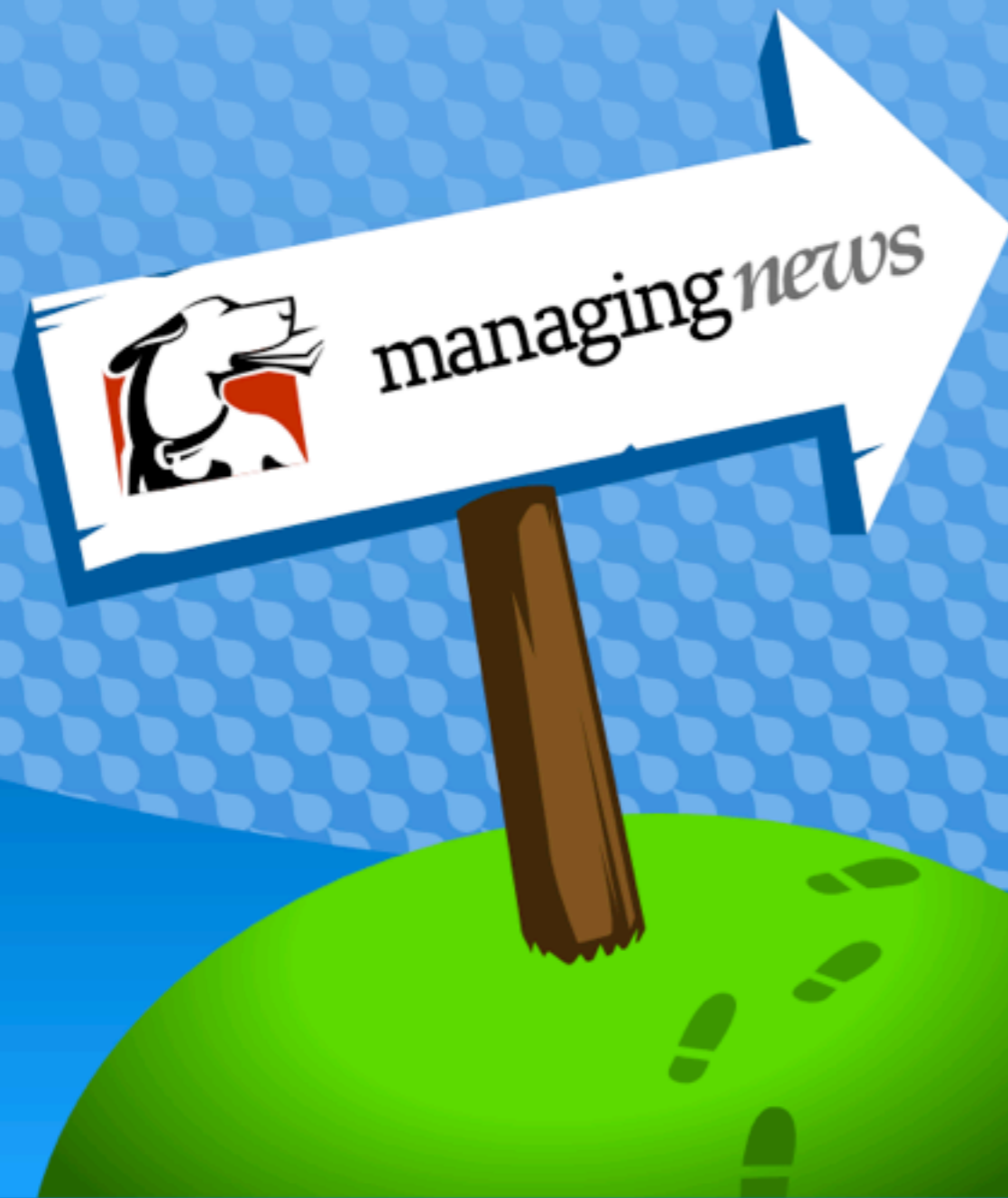
fig. 2 Tracking a user's path in Managing News