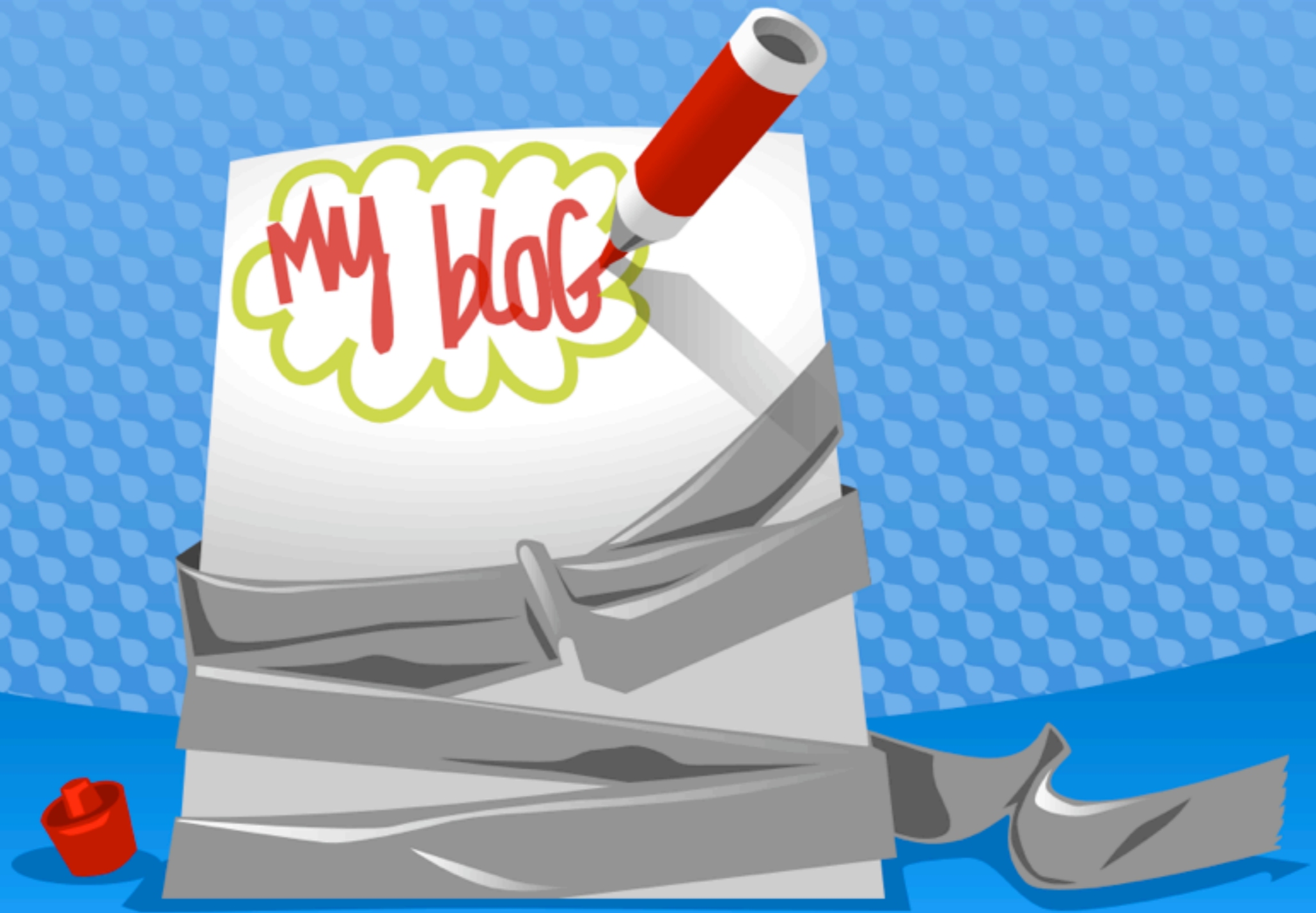
fig. 3 A quick + dirty demonstration of context on your site