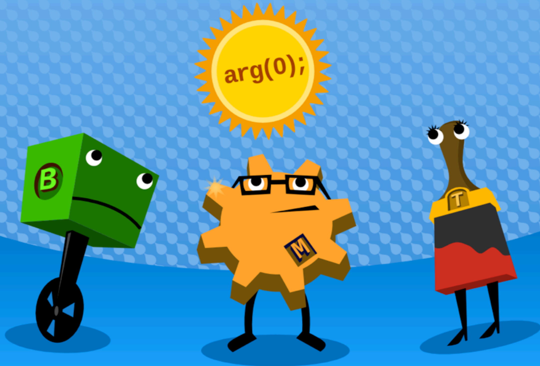
fig. 1 A block, module, and theme ponder how to react to arg(0)